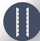
Dual Array Silicon Photonics Diode sensor