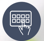
7in color touch screen