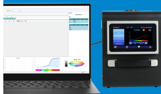
Color management software