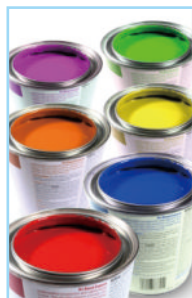
Paint & Ink